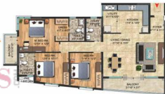
Type : 2B + 2T : 1330 sft. (Sold Out)