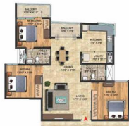
Type : 3B + 2T : 1716 sft.