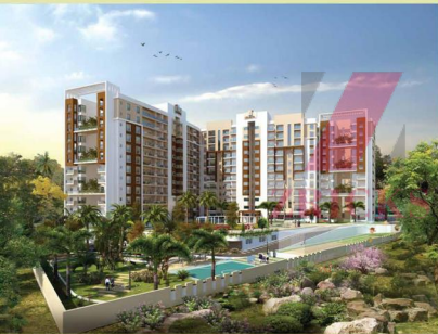
An Artist's view of Celesta

SENSIBLE ! ELEGANTLY DESIGNED FOR TRANQUIL LIVING