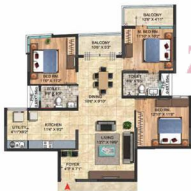
Type : 3B + 2T : 1626 sft. (Sold Out)